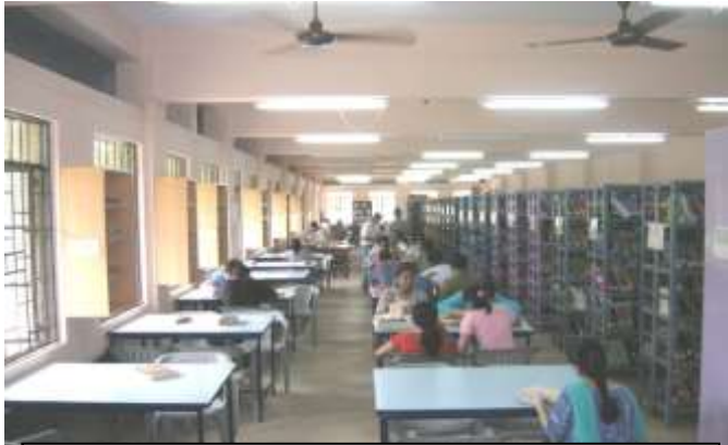
Lending and Journal Section (Area 218.23 Sq.m.)