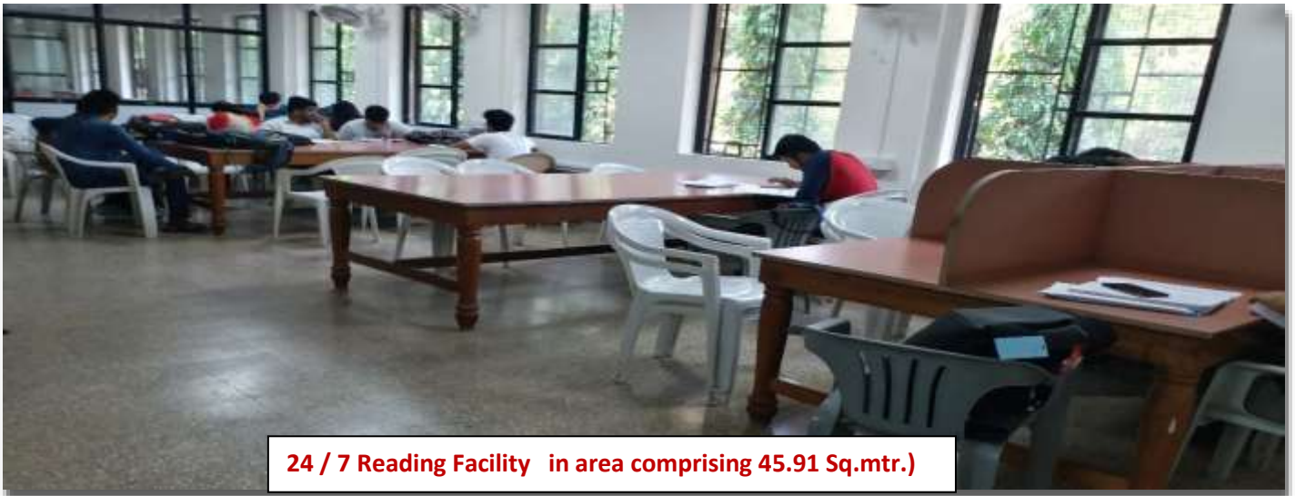
24 / 7 Reading Facility in area comprising 45.91 Sq.mtr.)