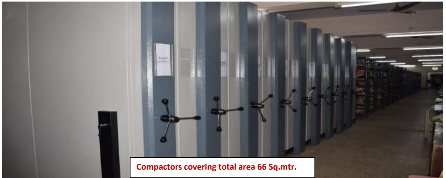
Compactors covering total area 66 Sq.mtr.