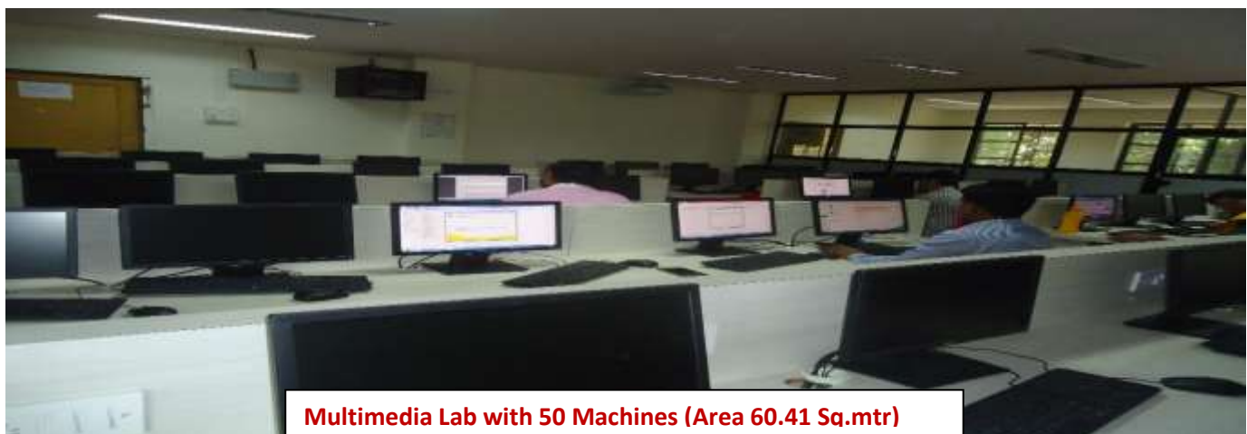
Multimedia Lab with 50 Machines (Area 60.41 Sq.mtr)